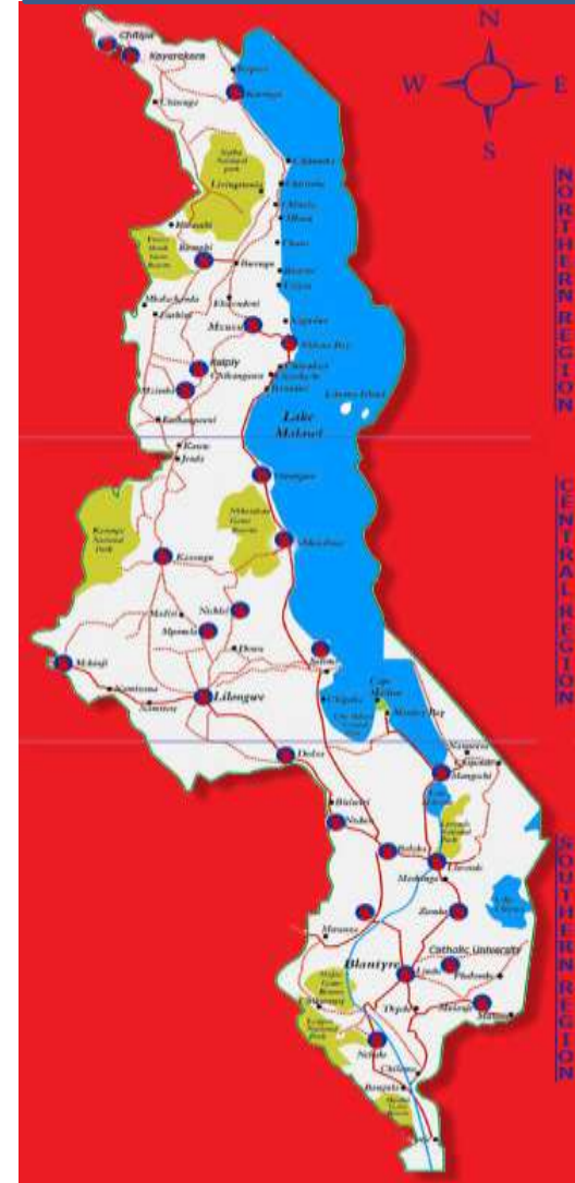
MAP OF MALAWI